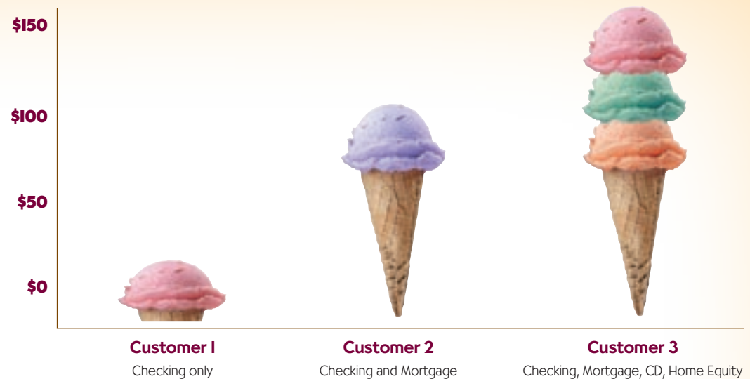
Three sample Mutual Rewards customers

This chart illustrates hypothetical account balances and simple interest calculations. For example, Customers #1, 2, and 3 have $1,000 average balances in their checking accounts, Customers #2 and 3 have a $200,000 mortgage, Customer #3 has an additional $50,000 CD and $20,000 Home Equity Loan at current rates.